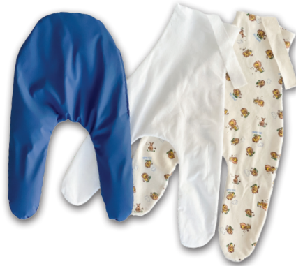
Wipeable Dandle PAL